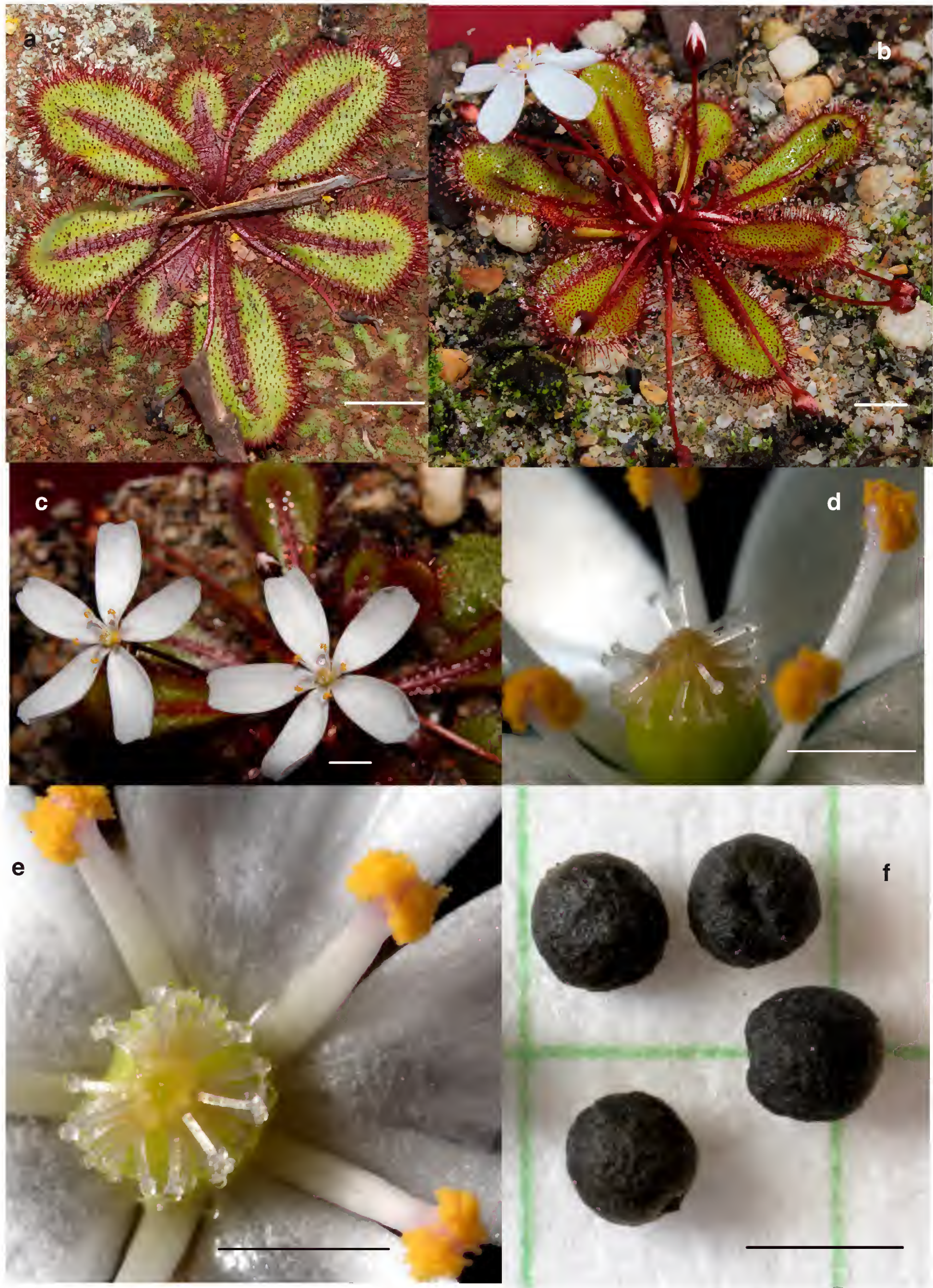
Fig. 3. Drosera bulbosa subsp. coronata : a , sterile rosette of leaves in situ; b , flowering plant (in cultivation); c , details of two flowers; d , details of stamens and ovary angled ventral view, showing naked apex of ovary above the annulus of styles and stamens with yellow pollen; e , details of centre of flower, ventral view; f , mature seeds (grid lines are 2 mm apart). Scale bar: a , b = 5 mm; c = 5 mm; d , e , & f = 1mm.